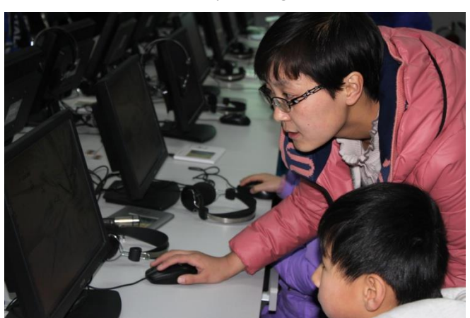
Primary school students in the poster-making class, "Children's Poster-making", TongWei County Public Library

Project "Cultivating Reading Habit of Migrant Children" implemented by Beijing New Century Dream Library is to promote family reading in the community of migrant workers. The project provided core readings, reading guide, and a 24-hour training workshop on both reading methods and early education theories. From the reading diary of 60 participated families, we found that most families got better understanding of early education and family reading, and over 2/3 of the families have formed family reading habit and mastered the basic reading method.