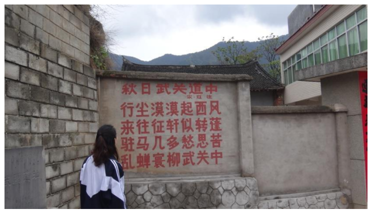
Student reading a wall-poem at Wuguan Site, "Local Culture and Classical Poetry Reading", DanFeng High School, Shaanxi

The Reading project of this year has evolved from "reading" to "walking". In the project of "Local Culture and Classical Poetry Reading", teachers of DanFeng High School guided students to research local poetry and relevant historical and cultural background, as well as historical sites or events recited by the poetry, such as local ancient gates. Field trips were also organized for on-site investigation. Students summarized collected information from reading and study, analyzed connotation of classical poetry, wrote review or evaluation thesis. Teachers and students teamed up to study and write on same topics, exchange ideas and grow together. From students' works, we can tell the enhancement of students' appreciation of classical poetry, the nourish they gain from local history and culture, and their tightened binding to hometown. During the project evaluation and retrospection, we also discussed with the project team of two possible directions to further improve the students' research ability and self-thinking. One direction is to improve non-fiction writing capability, since lacking of historical inquiry ability had been reflected in students'