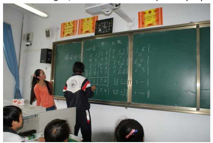
Student writing lyrics, "Campus Lyrics Creation Room", TongWei No.1 High School, GanSu

writings; to be more advanced, the project can further evolve to become a historical research and writing. The other direction is to widen the study from local poetry to all other aspects of local culture, such as dialect, local diet culture, etc. which are closer to the students' daily life, easy for them to investigate, and cultivate their ability to study beyond classroom and desktop.