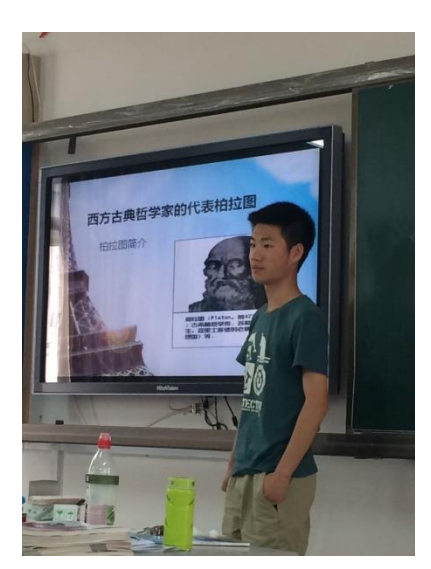
Students in the lecture contest, "Reading and Inquiry-Based Learning Pilot Project for A Class", Kaili No.1 High School, Guizhou

There are 2 typical examples of Classroom Inquiry Attempt: Project "Inquiry-based Learning in High School Chemistry Compulsory Courses" from DanFeng High School, and project "Constructive Geography Learning" from Huaian No.1 Middle School. The learning process is to explore against specific problems (such as how to calculate the height of the sun at noon), and is a process combined with practical application (for example, the height of the sun at noon can be used to derive the space between residential buildings). But the problems were textbook knowledge, not open inquiries arising from daily life. Thus it lacked of open inquiring, not enough to stimulate creativity of students. A real problem inquiry may require teachers to guide students to mobilize all kinds of knowledge and skills for interdisciplinary research, and to combine with professional resources. Evergreen schools need to further explore how to implement it.