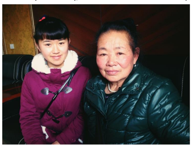
Student interviewing the Dong Story Master, "Collecting Southeast Guizhou Dong Minority Folk Stories", Kaili No.1 High School, Guizhou

Oral History and Local Cultural Study, including folklore and folk literature and art study, and community oral history, is the core of extra curricular inquiry-based learning.