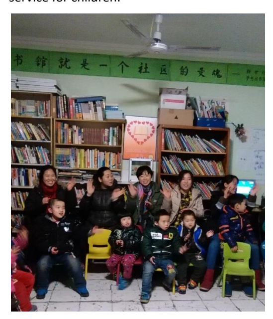
Family Reading Workshop, "Cultivating Reading Habit of Migrant Children", New Century Dream Library, Beijing

The public/community library project of this year focuses on innovation of community education service for children.