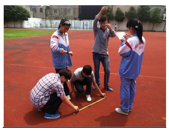
Students measuring the high angle noon sun, "Constructive Geography Learning", Huaian No.1 High School, Jiangsu

There are 2 typical examples of Classroom Inquiry Attempt: Project "Inquiry-based Learning in High School Chemistry Compulsory Courses" from DanFeng High School, and project "Constructive Geography Learning" from Huaian No.1 Middle School. The learning process is to explore against specific problems (such as how to calculate the height of the sun at noon), and is a process combined with practical application (for example, the height of the sun at noon can be used to derive the space between residential buildings). But the problems were textbook knowledge, not open inquiries arising from daily life. Thus it lacked of open inquiring, not enough to stimulate creativity of students. A real problem inquiry may require teachers to guide students to mobilize all kinds of knowledge and skills for interdisciplinary research, and to combine with professional resources. Evergreen schools need to further explore how to implement it.